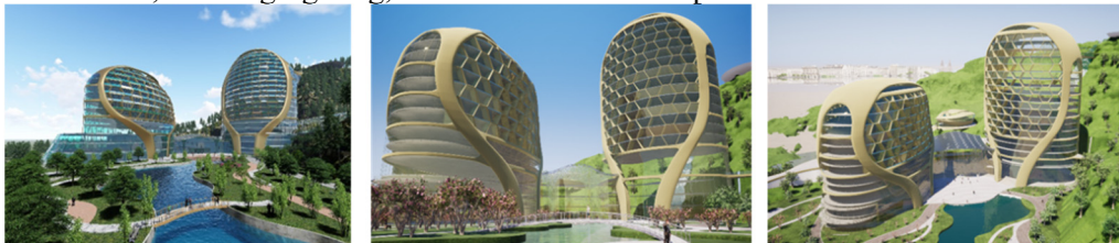
Figure 2. Comparison of design options by VR technology

By means of parametric and VR technology to generate a variety of curtain wall project overall and important node, the final plan of building facade and curtain wall was determined based on the factors of site environment, building lighting, structure and interior space.