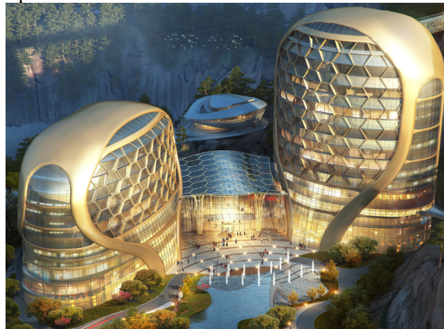
Figure 1. Nanjing honeycomb hotel

With a total construction area of 85,000 square meters, Nanjing honeycomb hotel has two towers A and B. There are three floors of podium buildings, underground banquet halls and reception centers, among which the highest height is 94.9m. Relying on the excellent natural ecology of laoshan, the concept of mountain cliff and honeycomb was combined to create the world legend of the hotel with the unique design concept and the super five-star hotel standard.